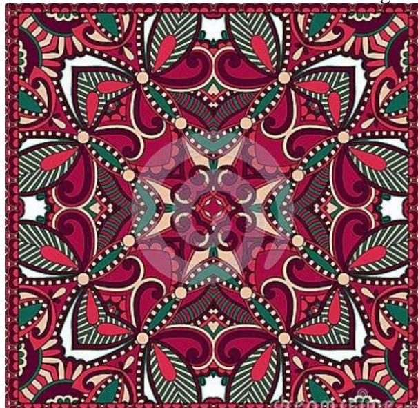
Figure 1 Chinese traditional decoration

The decoration includes wooden doors and windows, partitions, flower covers and railings. The style and shape of the door are varied and the decoration on the door is also various. For example, the wooden lattice of various patterns used for the leaked part of the door, the wood carving of the solid wood board, etc.; the cover is a kind of indoor partition, which separates the space in the senses and continues [1] . Chinese traditional decoration is shown in Figure 1.